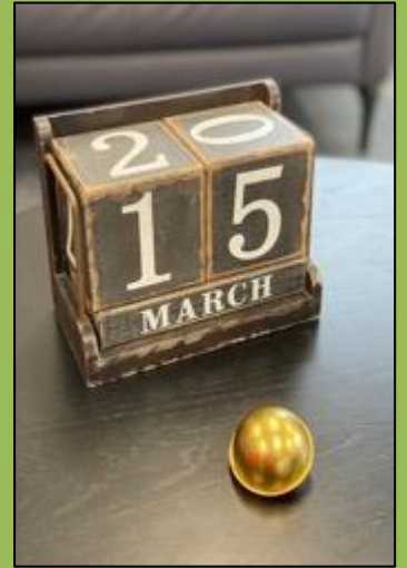
Different Comic Relief noses – a 2024 gold nose (1/60 th chance), a 2024 nose, a 2021 fox nose and a vintage nose from 1991, my favourite!