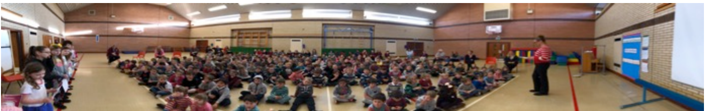
Spots and Stripes Day RNLI fundraising 26.1.18