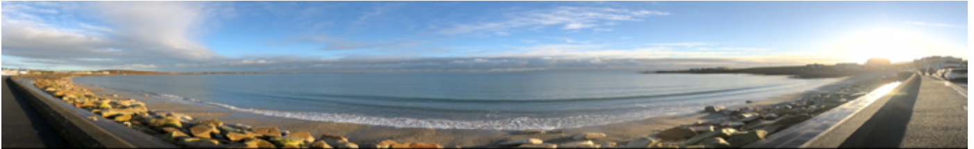
Gansey, our beautiful island 20.1.18