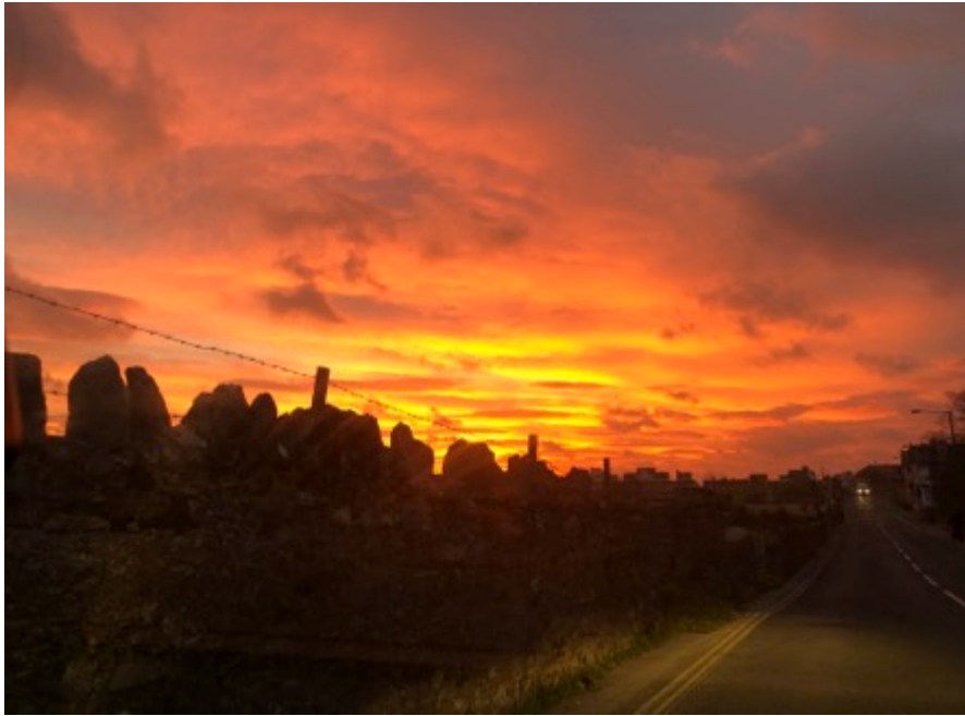
Early morning sky, Thursday 13 th December 2018

All the staff at Rushen Primary School wish you a very Merry Christmas and Happy New Year!