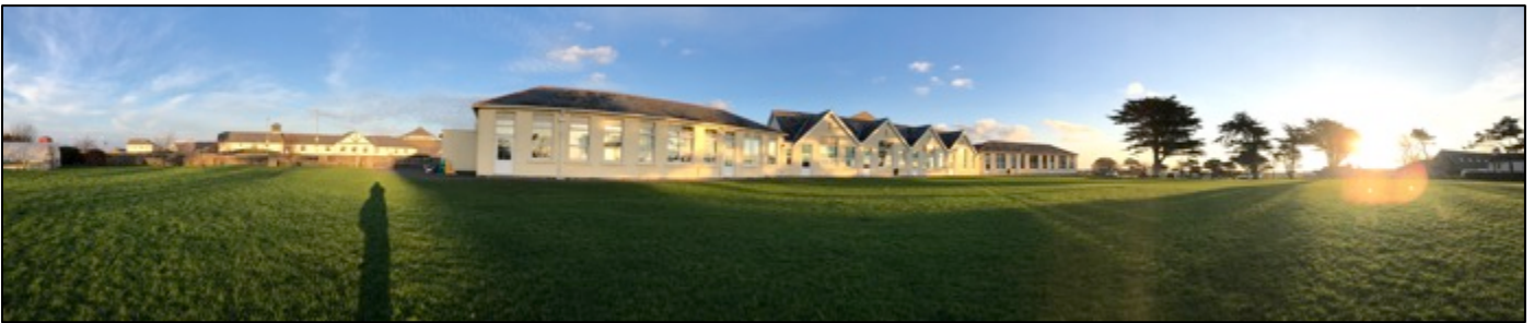
14.12.18 The calm before the storm...