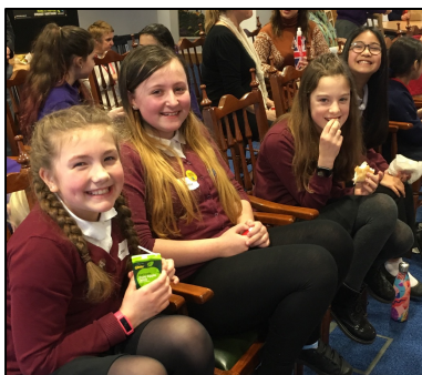
Fairtrade Workshop, Tynwald Building, Douglas