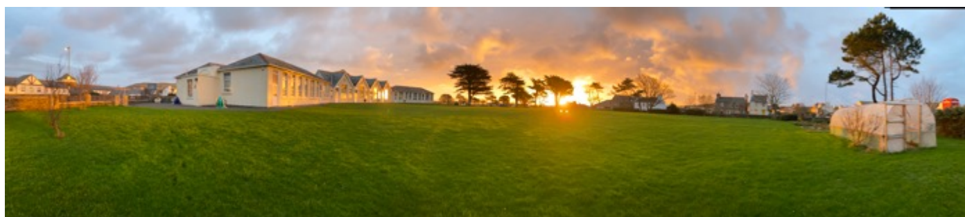
Rushen Primary School - a beautiful December morning 2020