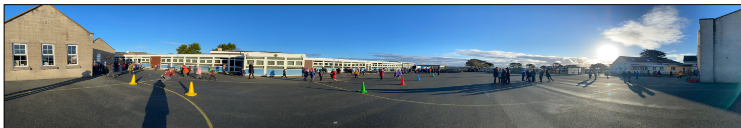
January 2021 (before lockdown 2.0)