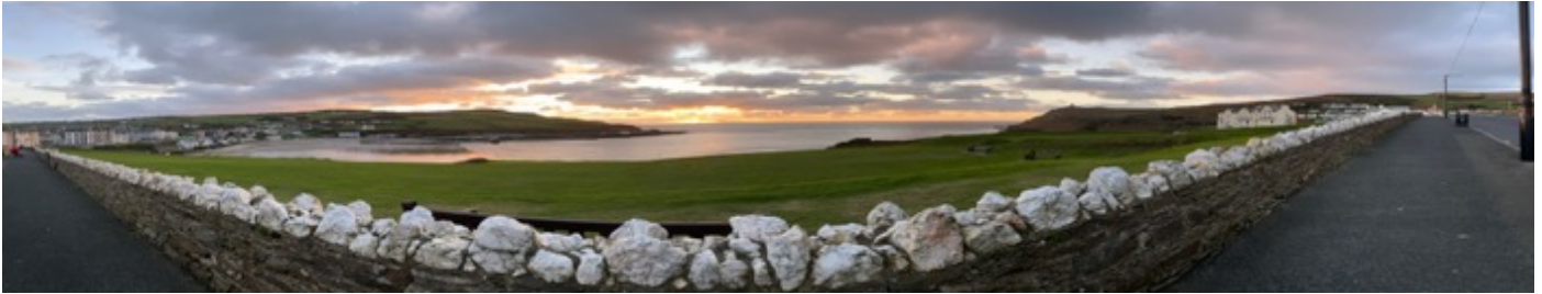
Port Erin, November 2021