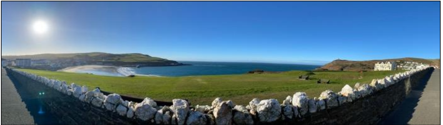
January 2022 Port Erin