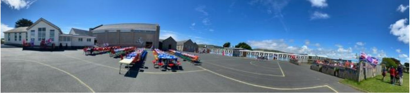
Queen's Jubilee Celebration 2022