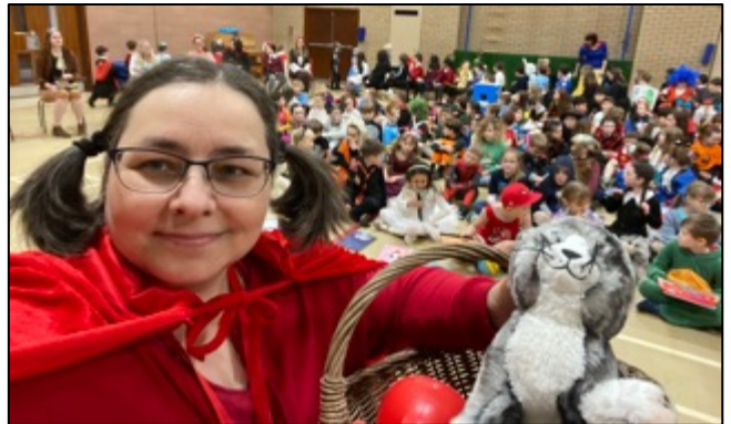
Little Red Riding Hood led assembly...