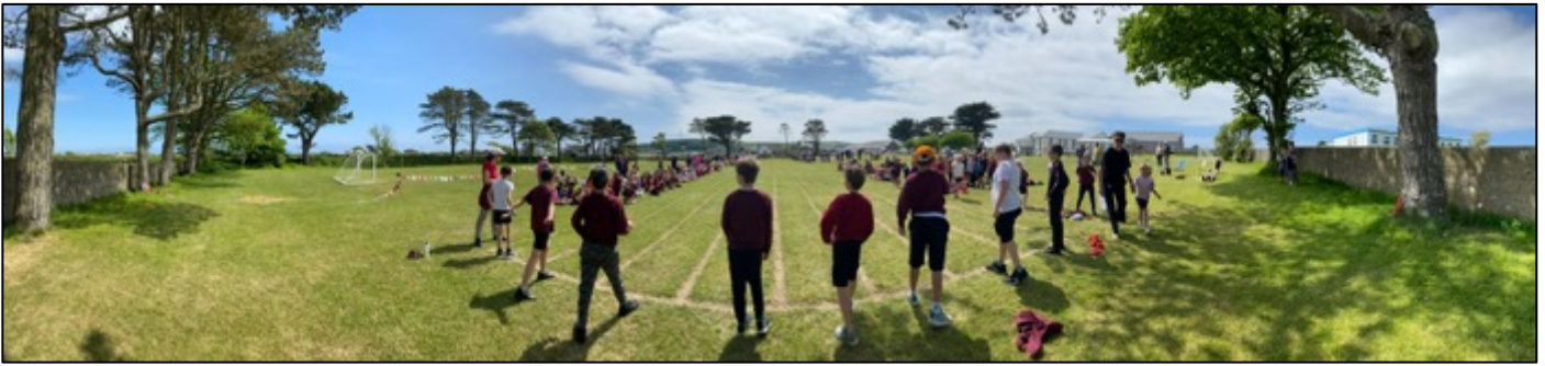
Sports Day 2023