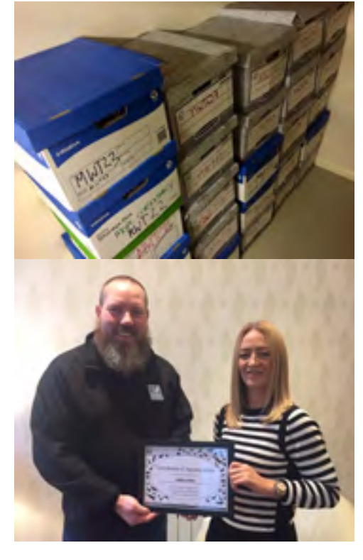
archive boxes at their facility in Douglas in return for a complimentary corporate

membership. We also have storage at Empire Garage in Peel, Sartfell Nature Reserve, Sunset Lakes in Peel and other places too. So you can get a picture of the scale of our problem.