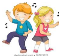
Dance to music