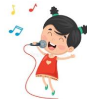
Sing a song